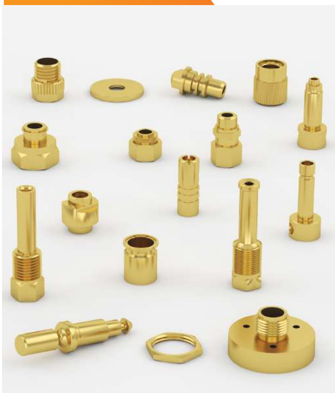
Brass Automotive Components