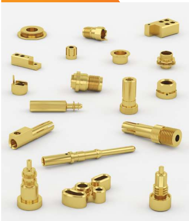
Brass Precision Components