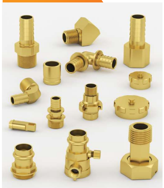
Brass Forged Parts