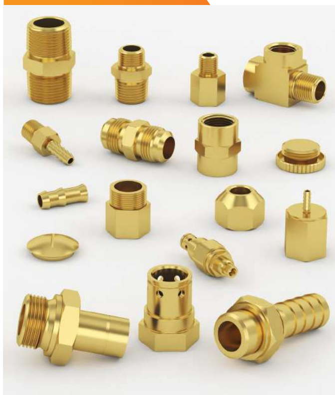
Brass Fitting parts